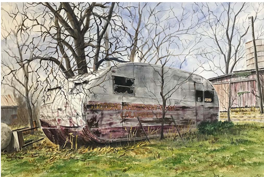
Not So Amusing (watercolor on paper, 12 x 18 1/4 inches)