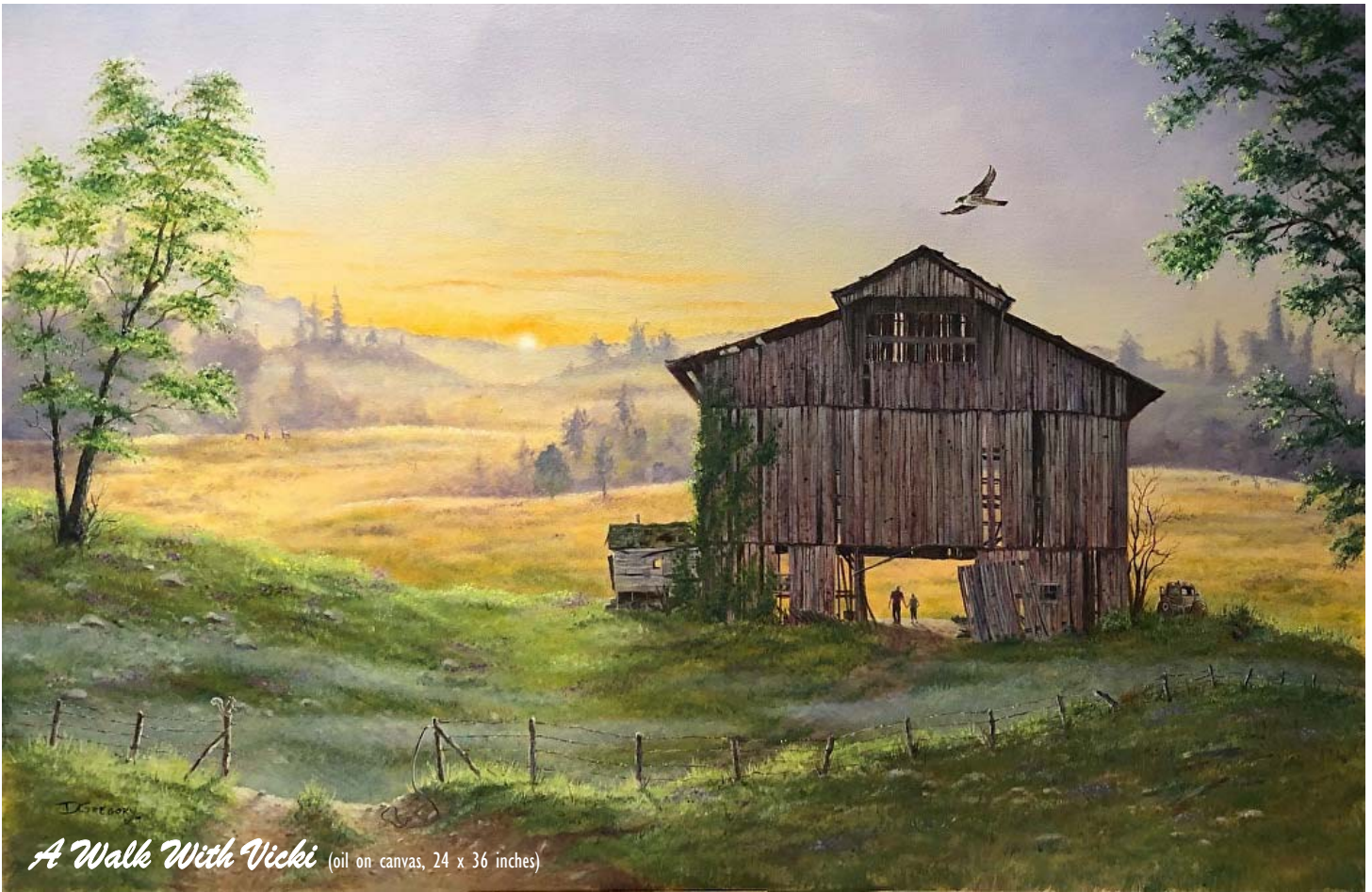
A Walk With Vicki (oil on canvas, 24 x 36 inches)

family waiting on Grandpa to come home from a tough day in the fields. The understanding and the solace gave this picture mix emotions of worry, safety, and protection into one loving