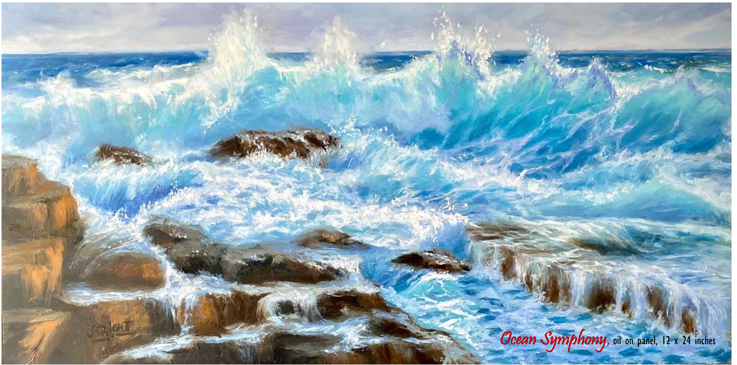
Ocean Symphony , oil on panel, 12 x 24 inches